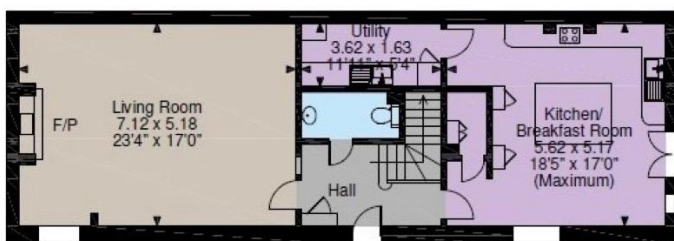
White Mere Ground Floor